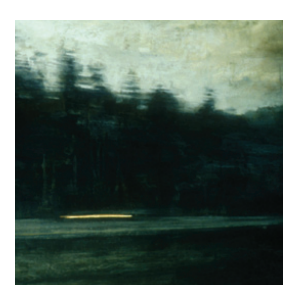
JAKE AND THE LEPRECHAUNS (2006)