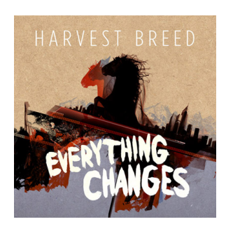
EVERYTHING CHANGES (Listen here)