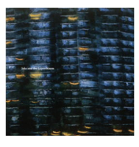
A LONG DASH (FOLLOWED BY TEN SECONDS OF SILENCE) (2008)