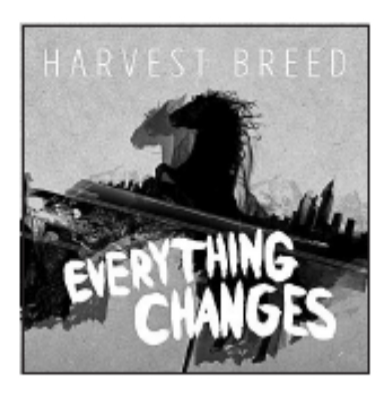
★★★☆☆ Harvest Breed