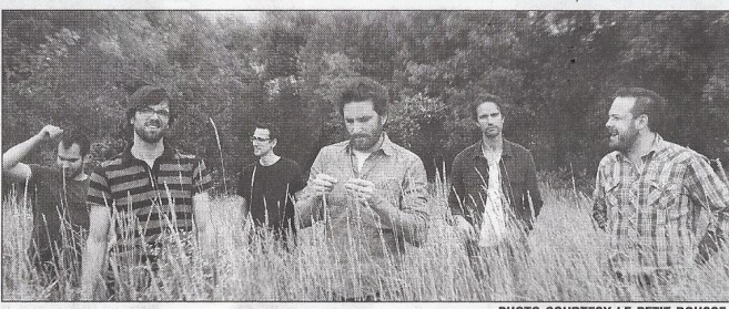
Harvest Breed is coming to the Centennial stage on November 24.

It all started growing up and playing in their parents' garage, a group of francophone youth who decided to take it more