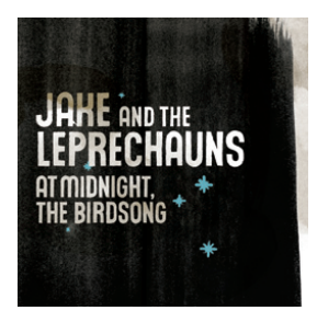
AT MIDNIGHT, THE BIRDSONG (2010)